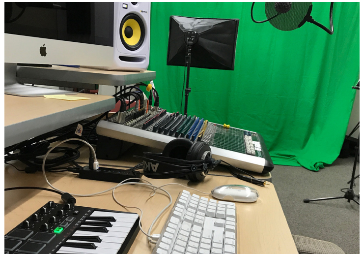
The Studio opened its doors this fall, offering personalized instruction for students and workshops for patrons.

The Library will soon see the leaves of autumn in our foyer and our students will begin filling the computer labs and work tables, earnestly striving to start their year on the right foot. When we remember our first days on campus, we think about how new everything around us seemed and how unfamiliar the world of college felt. The library works hard to create an environment in which our new students feel welcomed, both by our people and our facilities. Our donors are part of the team that help us create this atmosphere. We thank you for your gifts to the library, which help us launch our students on the pathway to success.