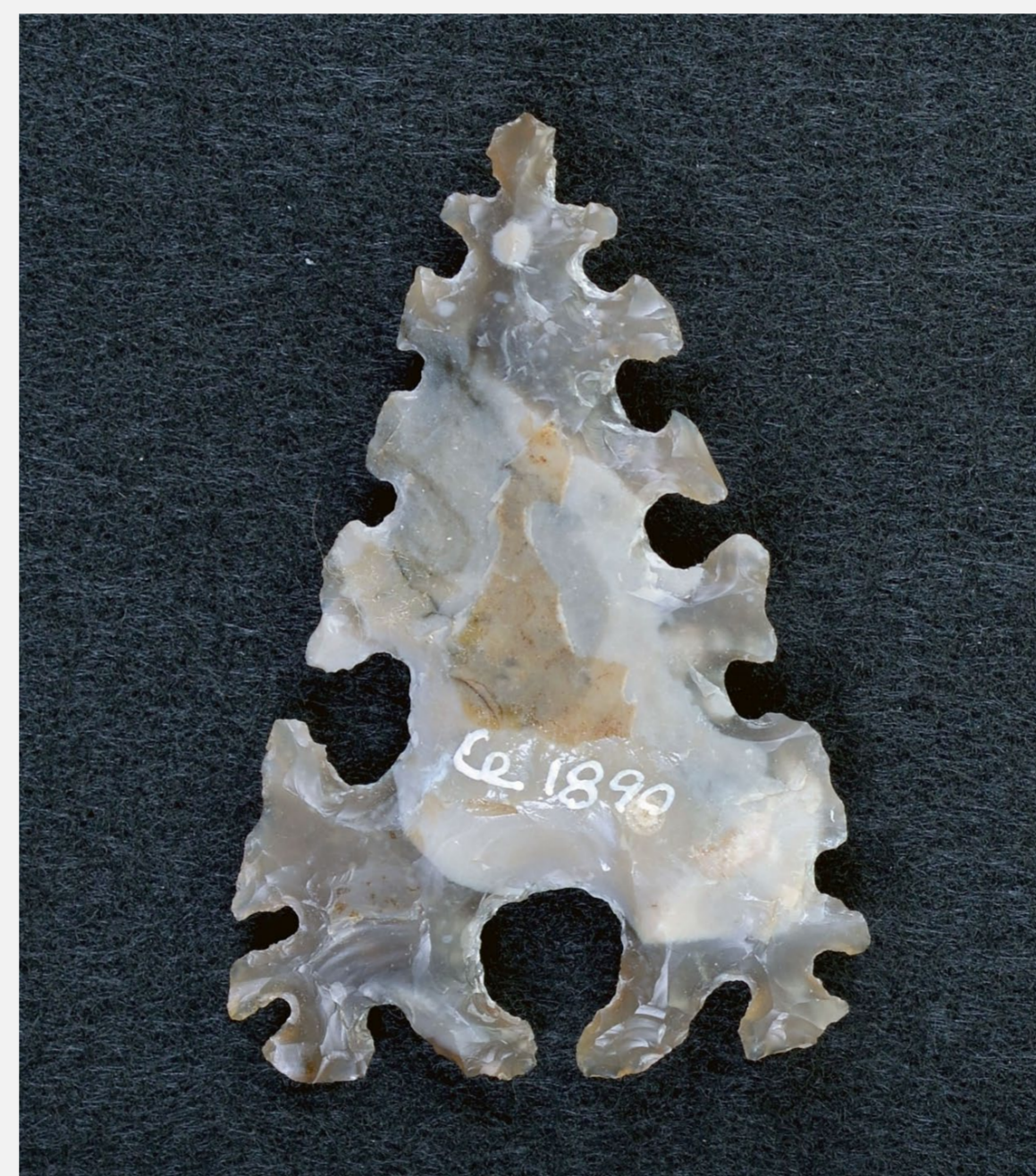
Crabtree Lithic Technology Collection