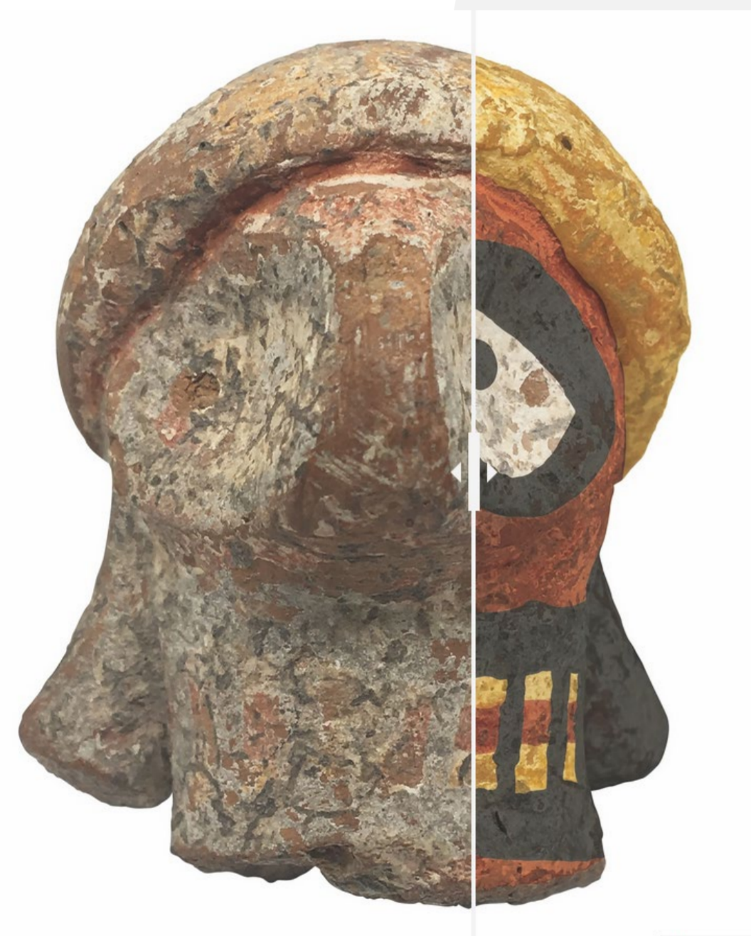
Judean Pillar Figurine Exhibit