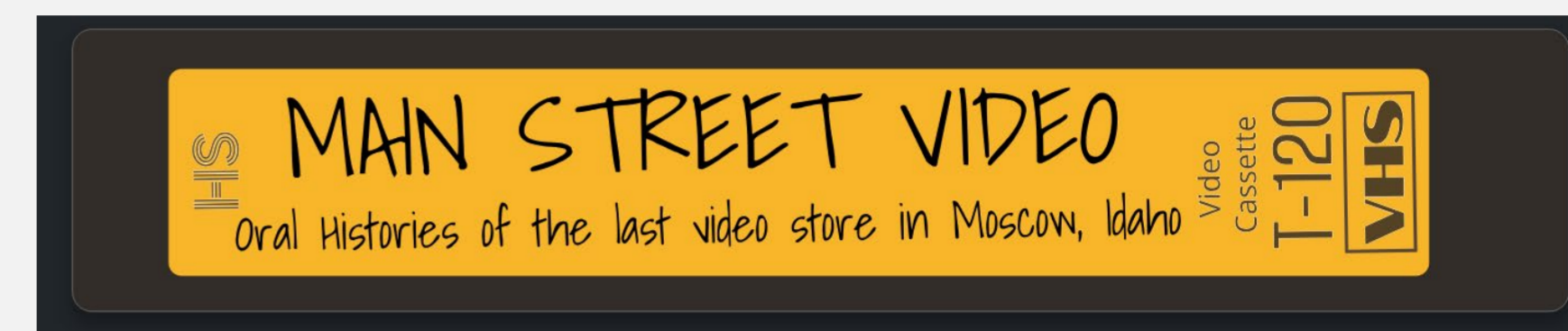
Main Street Video