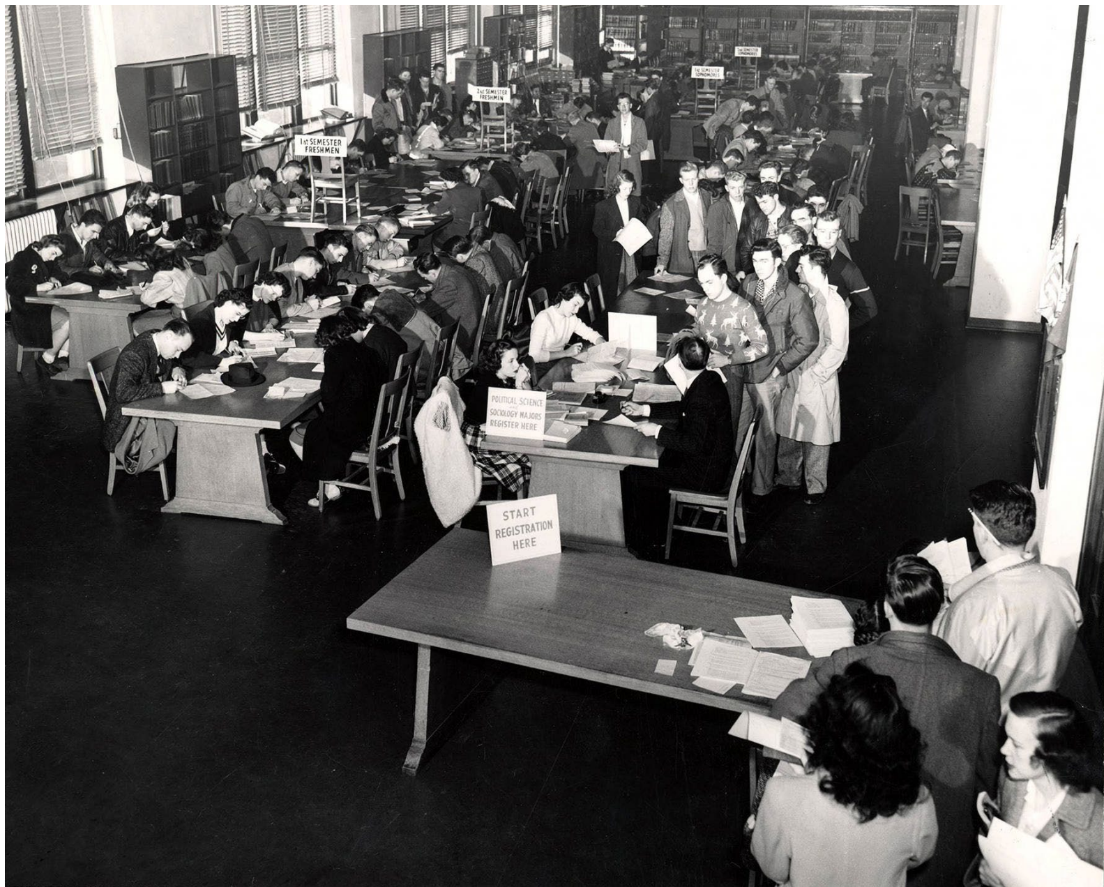
“Students register for classes in the library, then located in the Administration Building, 1946.”

This issue features information about the campus-wide course-marking initiative, oral histories, digital collections of jazz archives, and more.